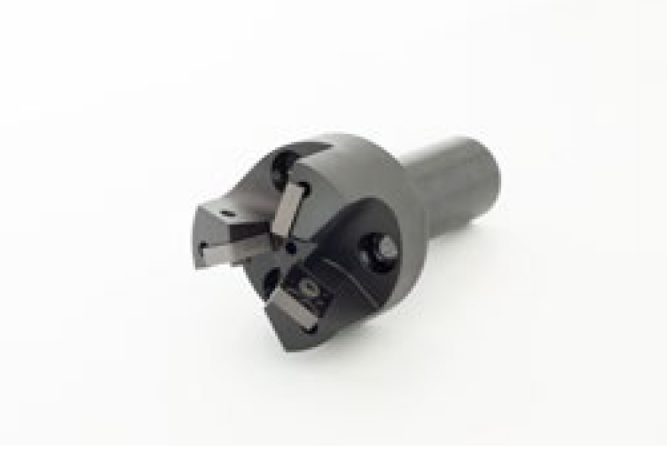
Havşa Açma Aparatı (Saplı) Chamfering Tools with Shaft