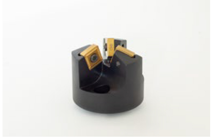
Havşa Açma Aparatı Chamfering Head