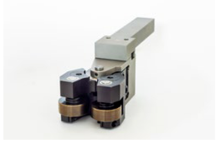
Teğetsel Ovalama Aparatı Tangential Rolling Head

Üstün kaliteli, uzun ömürlü ve çok yönlü diş açma çözümleri. High quality, durable and versatile thread rolling solutions.