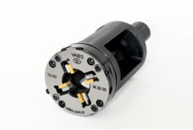
Tornalama Aparatı Turning Head